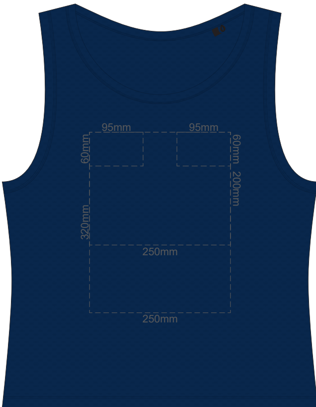
FRONT WOMEN'S 3XL

15% of Actual Size Colourflex Transfer Faux Embrodery