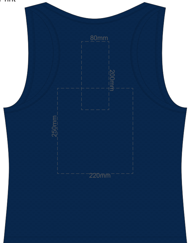
BACK WOMEN'S 2XL

15% of Actual Size Colourflex Transfer Faux Embroidery