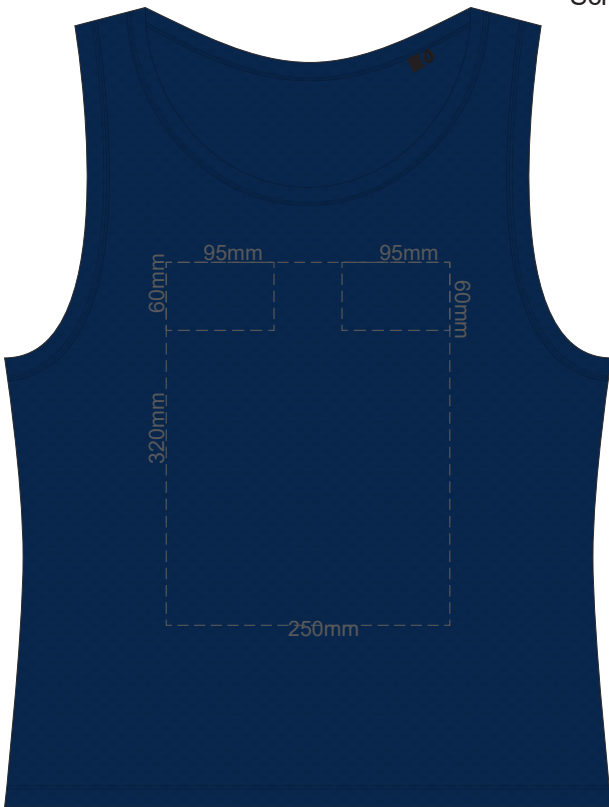
FRONT WOMEN'S 2XL