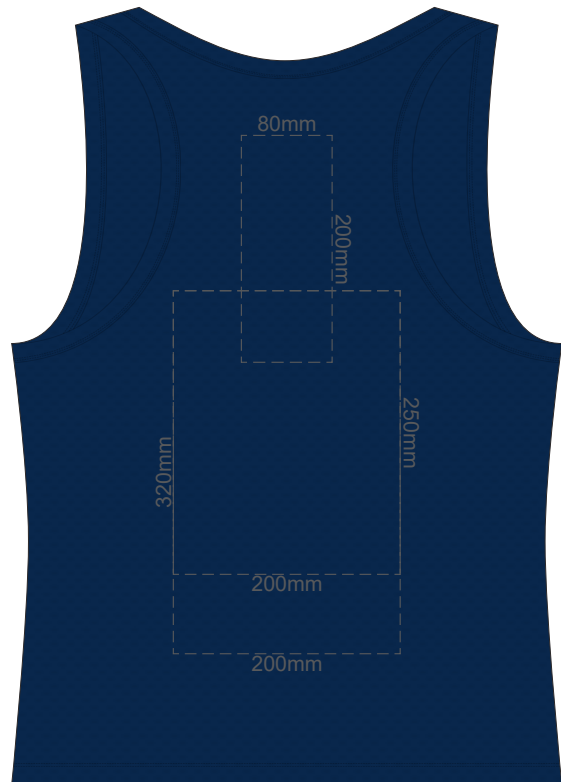
BACK WOMEN'S LARGE

Print area 250x200mm can be rotated to best suit