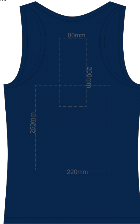
BACK WOMEN'S EXTRA SMALL

15% of Actual Size Colourflex Transfer Faux Embroidery