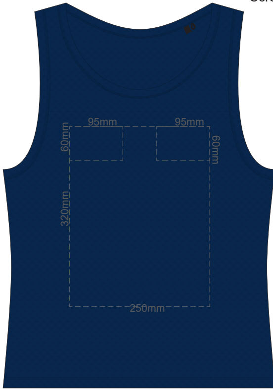
FRONT WOMEN'S LARGE