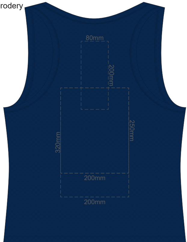
BACK WOMEN'S 2XL

Print area 250x200mm can be rotated to best suit