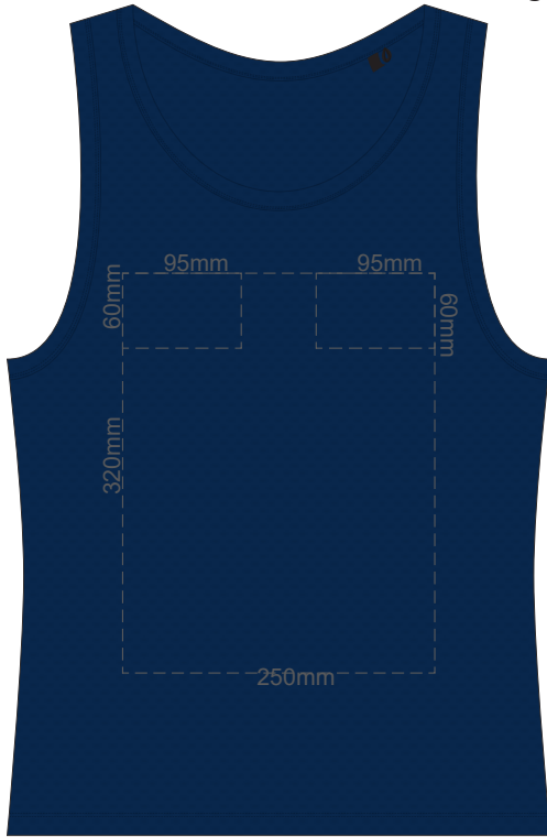
FRONT WOMEN'S SMALL