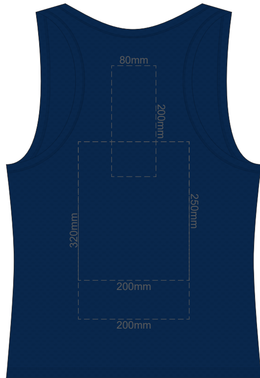
BACK WOMEN'S MEDIUM

Print area 250x200mm can be rotated to best suit