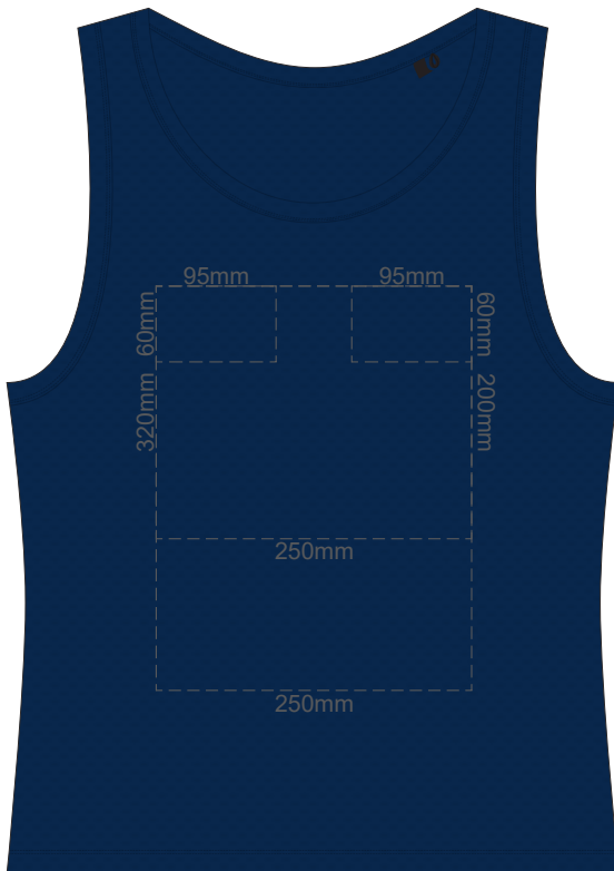
FRONT WOMEN'S LARGE

15% of Actual Size Colourflex Transfer Faux Embroidery