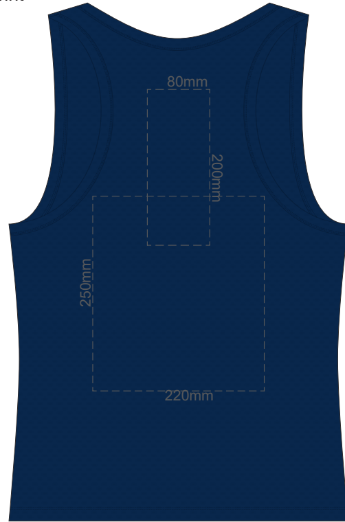
BACK WOMEN'S SMALL

15% of Actual Size Colourflex Transfer Faux Embroidery