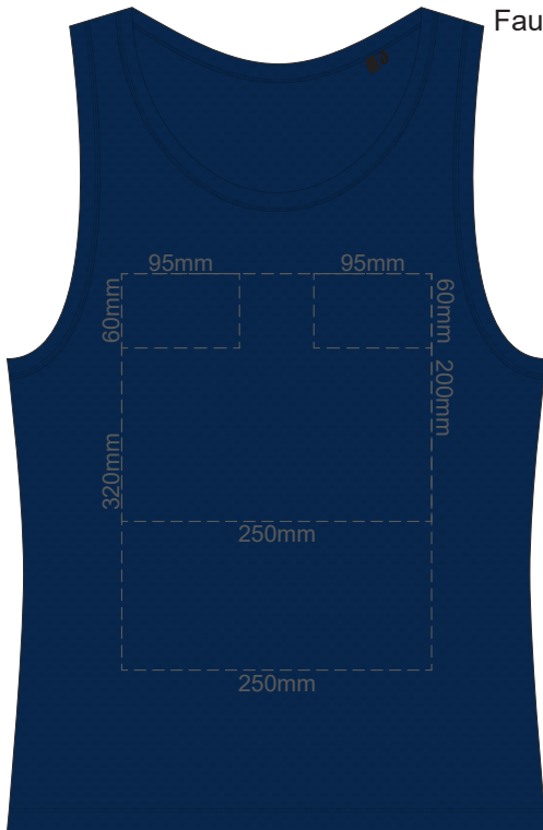
FRONT WOMEN'S SMALL

15% of Actual Size Colourflex Transfer Faux Embroidery