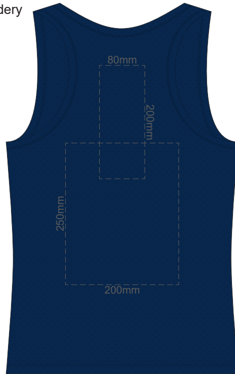
BACK WOMEN'S EXTRA SMALL

Print area 250x200mm can be rotated to best suit