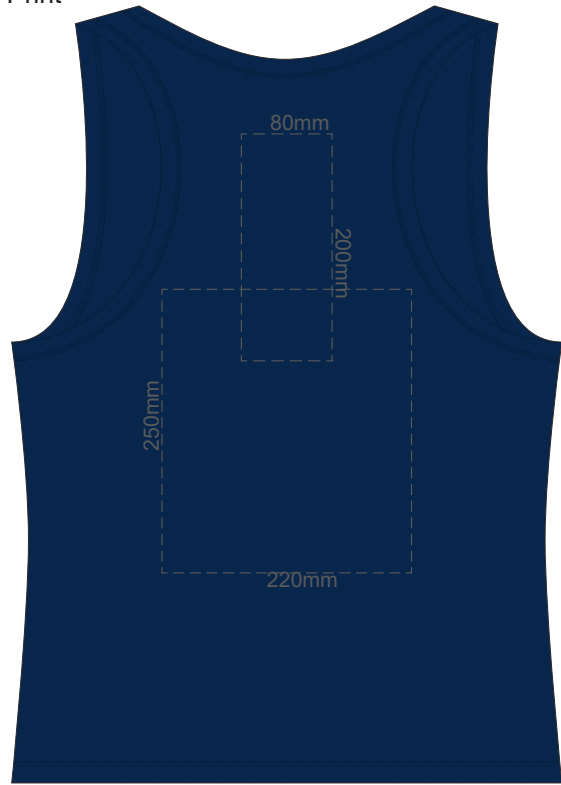
BACK WOMEN'S LARGE

15% of Actual Size Colourflex Transfer Faux Embroidery