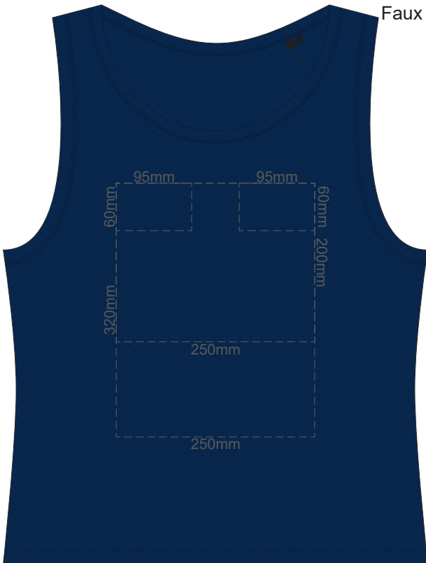
FRONT WOMEN'S 2XL

15% of Actual Size Colourflex Transfer Faux Embroidery