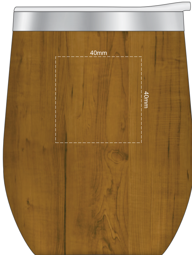
100% of Actual Size Pad Print