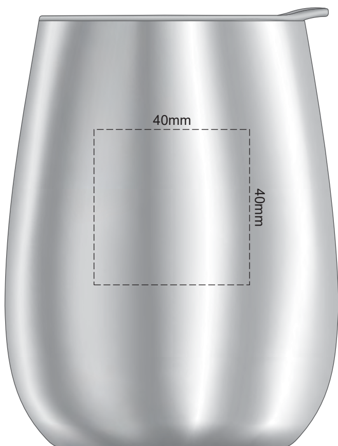
100% of Actual Size Pad Print